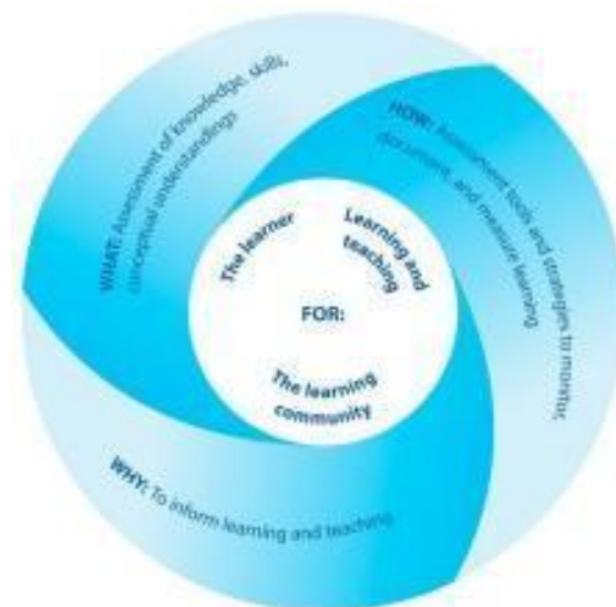
Figure AS01 Integrating assessment

Assessment starts at the beginning of the unit planning and serves a food for thought for teachers, students and stakeholders. Effective PYP assessment practice integrates assessment for, of and as learning to support effective learning and teaching.